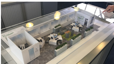
HR area model. Kenwood | Internship 2017