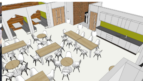
Sketchup visuals. Kenwood | Internship 2017