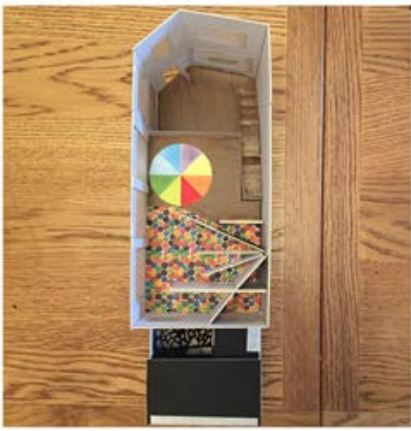
Figure 5: Scale model 1:50 for my coffee shop proposal.