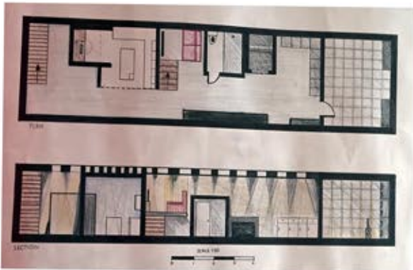
Figure 7: Atmospheric plan and section.