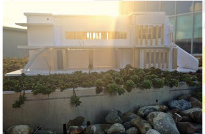
Figure 1: Scale model of assigned building.