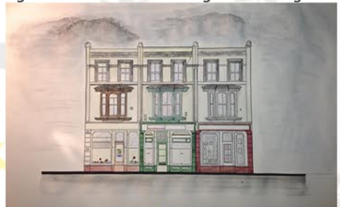
Figure 2: Rendered technical drawing.