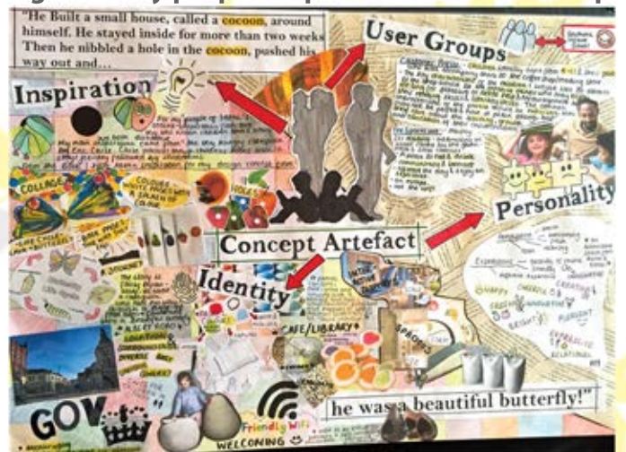
Figure 4: Artefact expressing my ideas and theme.