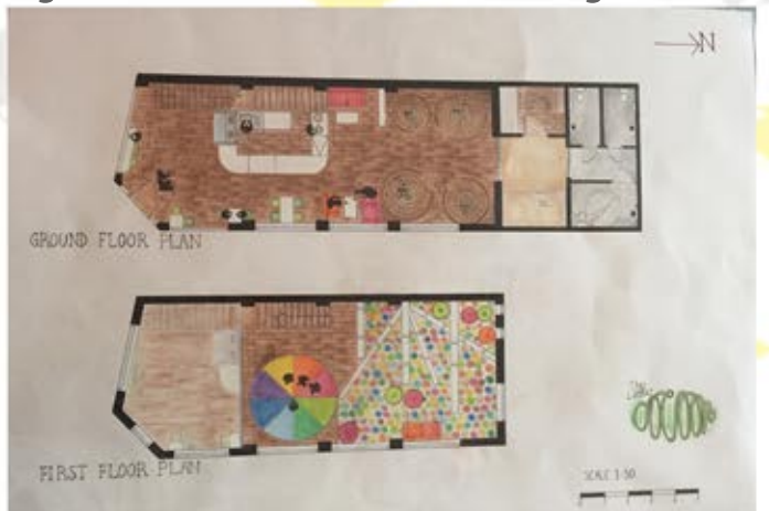
Figure 3: My proposed plan for the coffee shop.